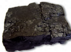
Fig. 3.1: Coal

You may have seen coal or heard about it (Fig. 3.1). It is as hard as stone and is black in colour.